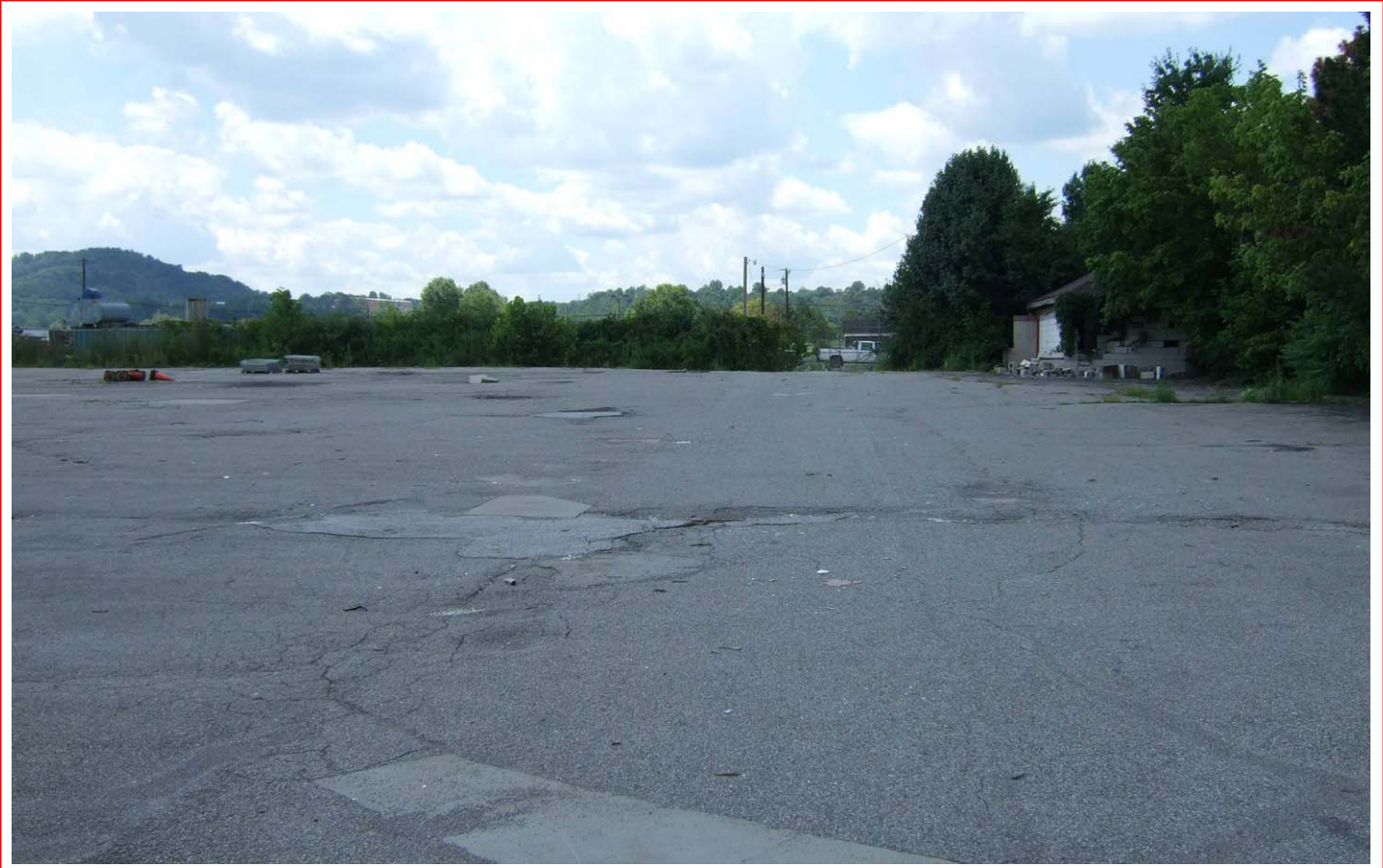
2 ACRE STORAGE YARD