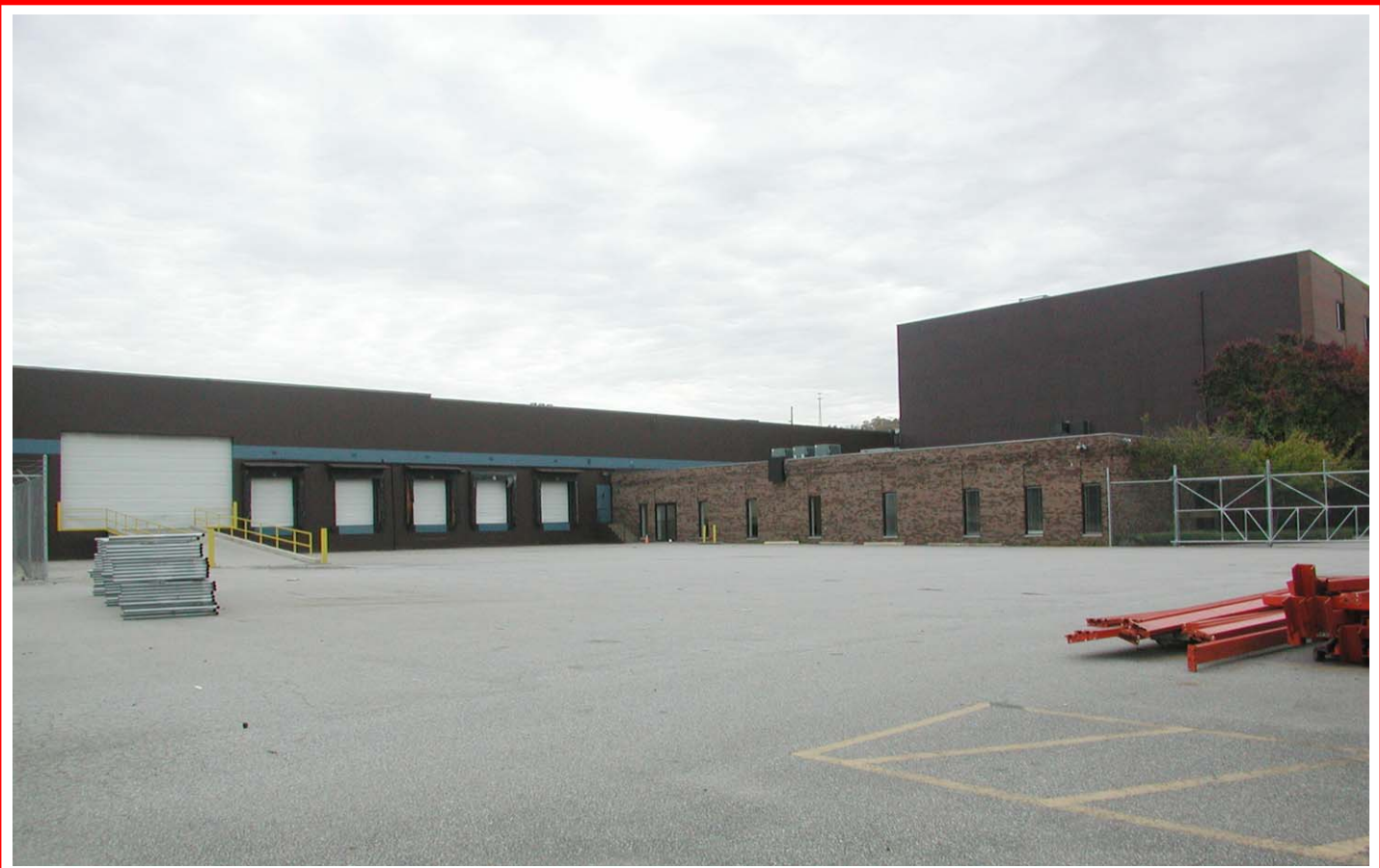
LOADING AREA AND OFFICE SPACE